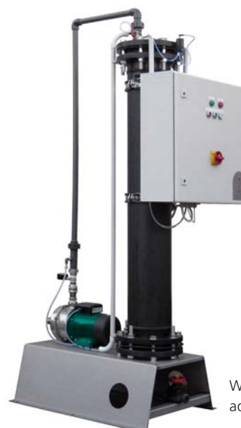
Westfalia Separator® aquaflow