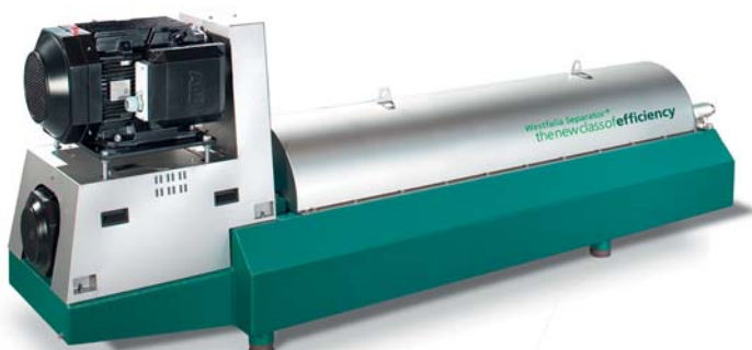
Decanter UCF 466

There are various options available for the treated water: it can be recirculated into the process, fed to an indirect supply or treated further – by membrane technology, or by biological or chemical processes, for example.