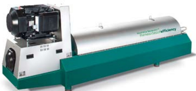
Decanter UCF 466

There are various options available for the treated water: it can be recirculated into the process, fed to an indirect supply or treated further – by membrane technology, or by biological or chemical processes, for example.