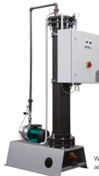
Westfalia Separator aquaflow